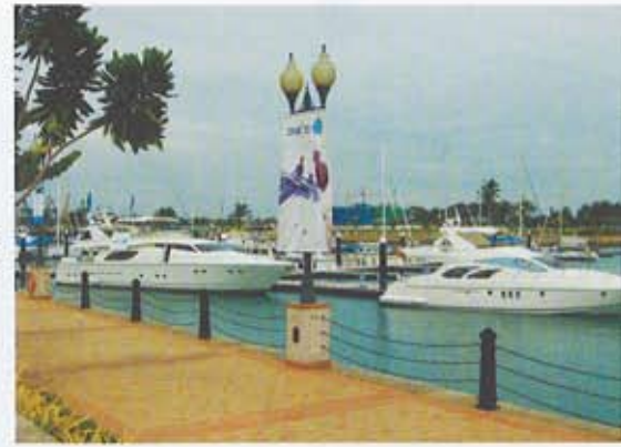
Yachts already moored up at One °15 Marina.

The marina has also welcomed its earliest superyachts. As the only marina in Asia that is purpose-built to berth up to ten megayachts at any given time, it has already received visits from large vessels from around